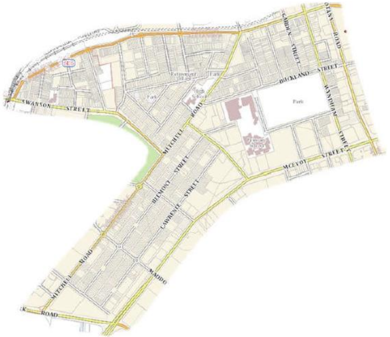
Figure 1.1: Study Area